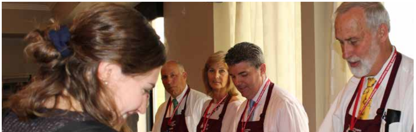
Board Directors serve and connect with members during the Annual Meeting.

Members may call in their RSVP to the Member Service Center at 1-877-892-0001 or email at 2020annual-meeting@choptankelectric.coop .