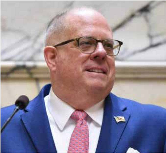
Governor Lawrence J. Hogan, Jr.

The CARES plan goes beyond a proposal passed by the General Assembly in 2019.