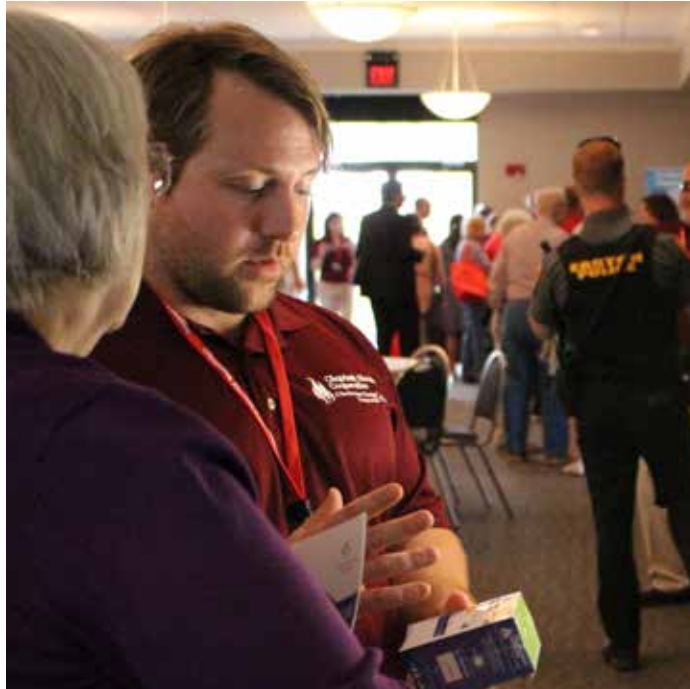
Speak with our qualified staff about energy-efficiency questions and products.