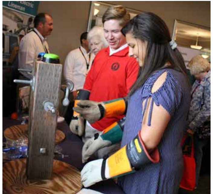
Attendees enjoy the "Lineman Challenge," a fun activity in which participants try their hand at conducting lineman tasks with real equipment.