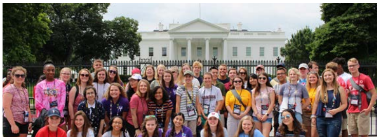
NRECA Youth Tour Pg. 19