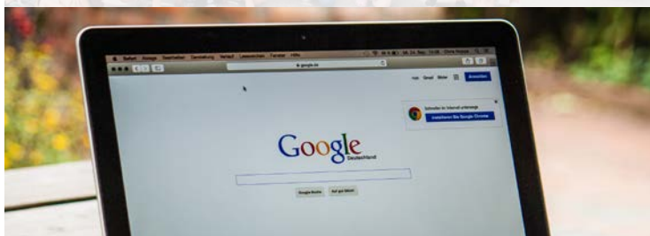
Broadband: Our Next Challenge Pg. 20