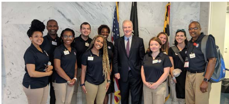
Sen. Chris Van Hollen with the Maryland participants and chaperones in front of his office.