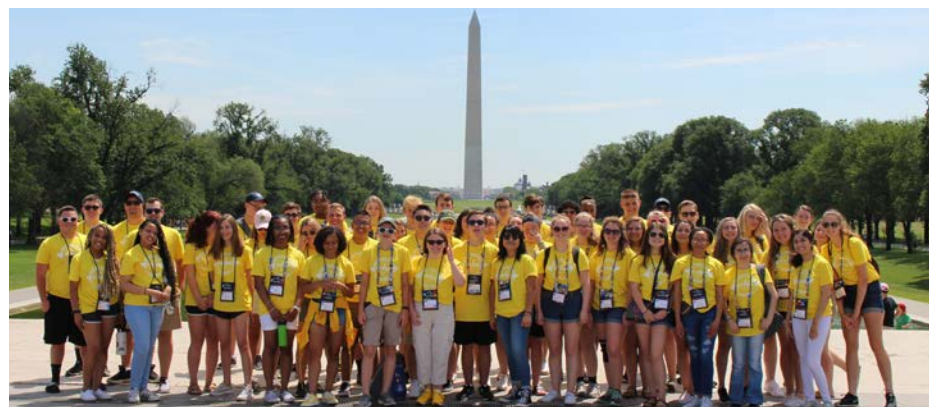
The Maryland, Virginia and Delaware assembly poses together in front of the Washington Monument.