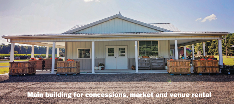
Main building for concessions, market and venue rental